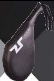
Single Kick Target