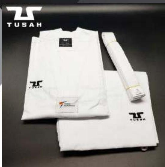
Tusah White V Neck Plain Back Uniform

Tusah White V Neck Plain Back Uniform Elasticated drawstring waist. Jacket has a plain back and is 80%polyester 20%cotton ribbed material. Tusah embroidered logo right chest and leg, underneath the collar on the back and WT embroidery on the back bottom of the suit. Extra stitched sleeves and trouser bottoms. Full length gusset. White V Neck. Complete with white belt. WT Approved. Sizes: 90cm-210cm