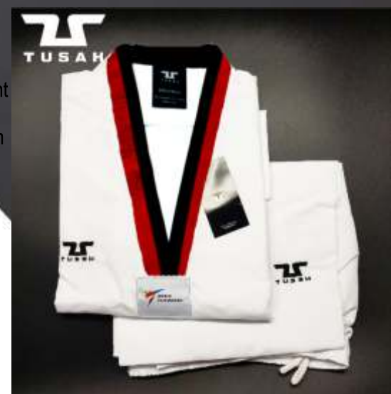
Tusah Terra Uniform

Tusah Poom Uniform Elasticated drawstring waist. Jacket has a plain back. 80% polyester 20% cotton ribbed material. Tusah embroidered logo right chest, leg and underneath the collar. Extra stitched sleeves and trouser bottoms. Full length gusset. WT Approved Sizes available: 130cm-160cm.