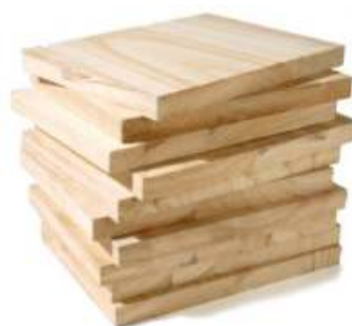
Wooden Break Boards

Available to order by factory direct minimum of 50 boxes.